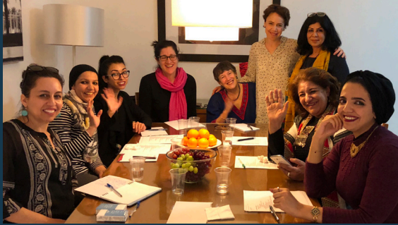
The HSI Collective